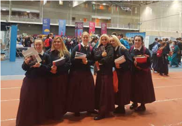
Leaving Certificate students attending the UL Careers Fair. All 3rd level & PLC colleges were present.

BEAT THE STREET: Beat the street initiative has begun at Colaiste Nano Nagle