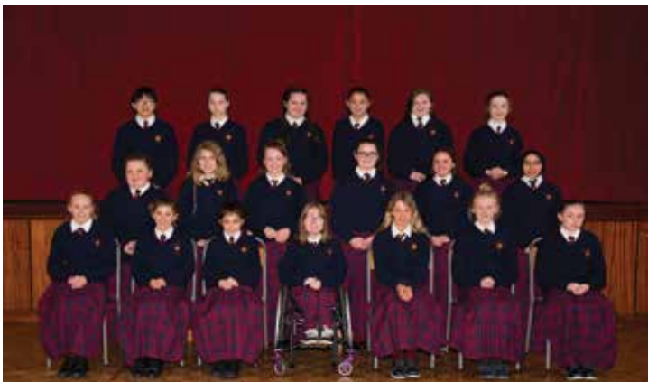
1st Year Boland