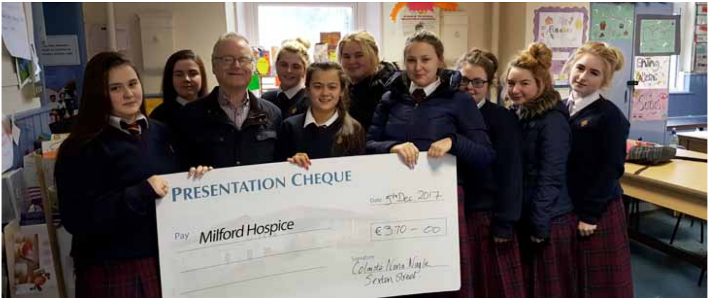
6LCA's presenting a cheque to Milford hospice for €370, raised by staff and students