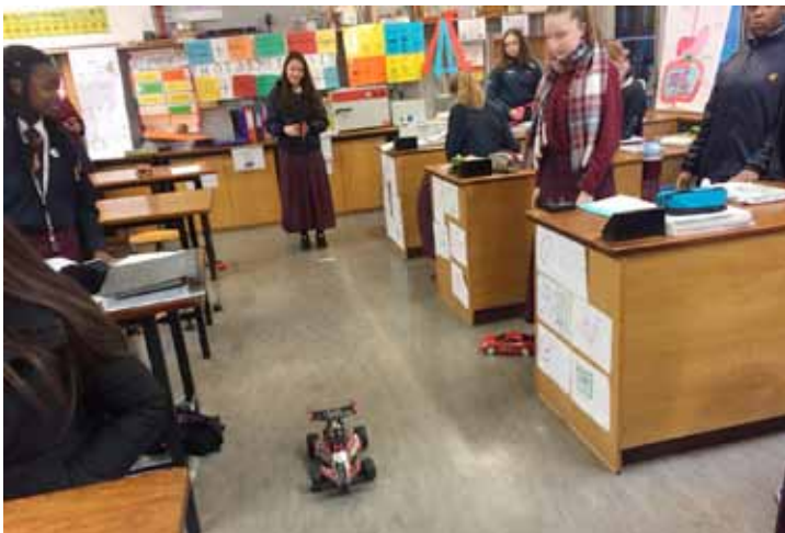
Third years calculating speed