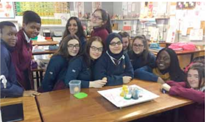
Fifth years demonstrating diffusion