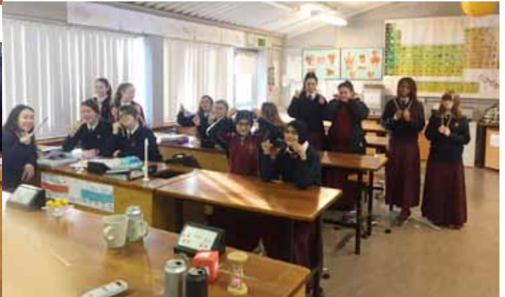
Science week 2017