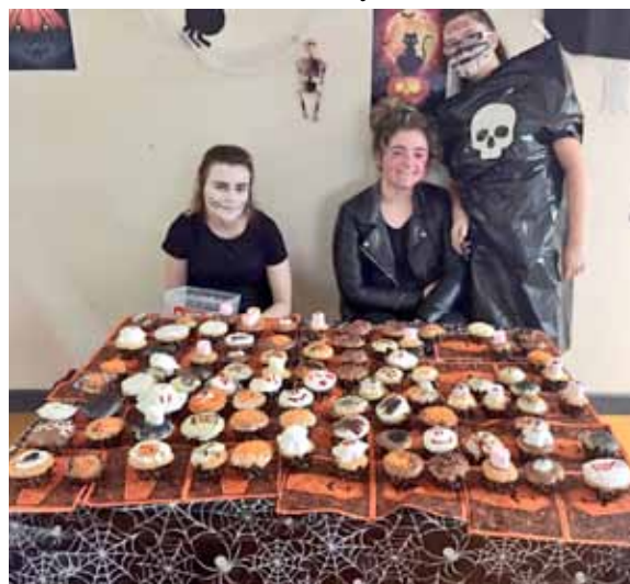
Look at all those cupcakes!!