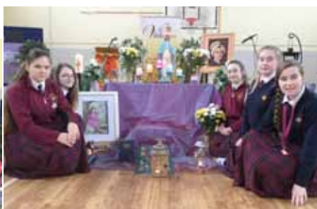
Gift bearers sitting in front of our sacred space which include an image of our lady, bible and a lantern all used by Nano Nagle in her life