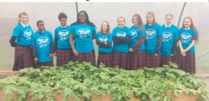
Fifth year ag science students wearing their t-shirts from the Farmers Journal.