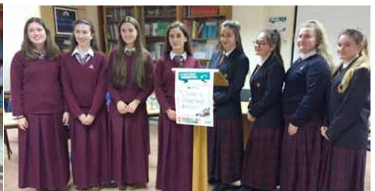
Laurel Hill Coláiste, FCJ and Coláiste Nano Nagle Debate Teams