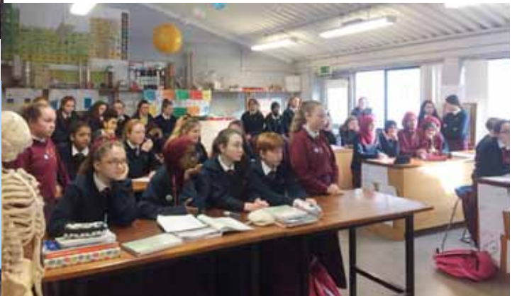
Science week 2017. Second and third years were treated to a science magic show.