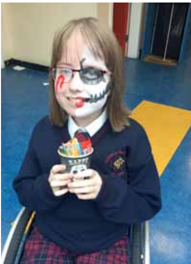
A happy customer from the event!